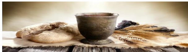
Communion Sunday October 6 th

Of course, either organization would accept monetary donations as well.