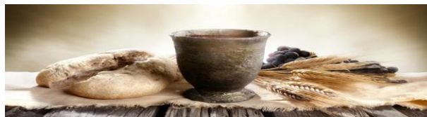
Communion Sunday August 11th

Of course either organization would accept monetary donations as well.